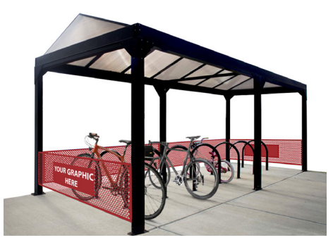
Newport w/Corral Panels