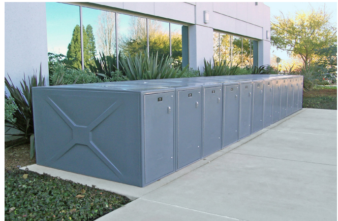
Bike Lockers 302