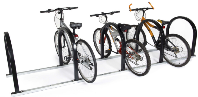
UC-5-SQ-PCBLK (holds 10 bikes)